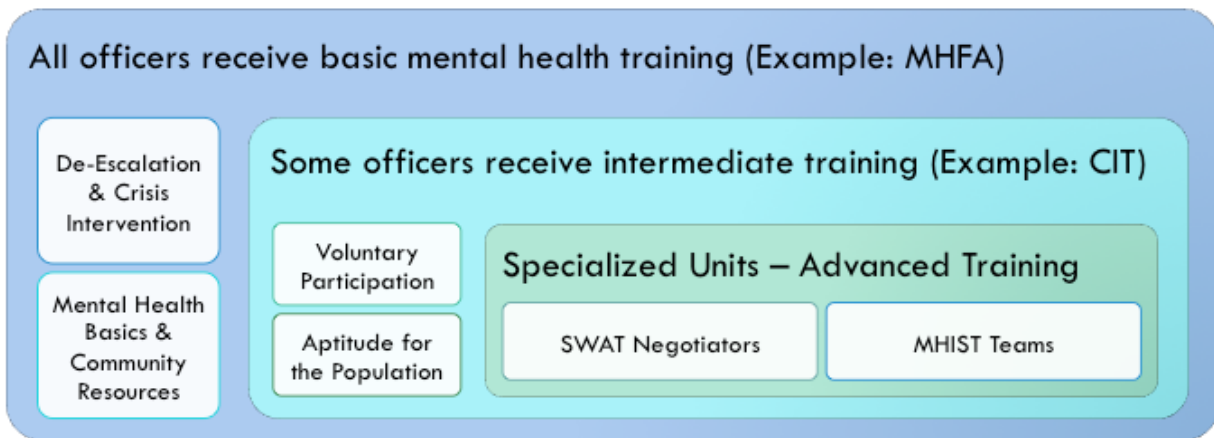
Figure 3: The Tucson MHST Training Model. All officers receive basic training in Mental Health First Aid (MHFA). Select officers receive intermediate Crisis Intervention Training (CIT) and focus on response to behavioral health crises. A specialized MHST team receives advanced training and focuses proactive recognition, investigation, and prevention of potential behavioral health crisis and associated threats to public safety. MHST team members serve as a resource for both CIT and non-CIT officers/deputies in the field who have questions or need help with complex cases. MHST also supports the modern paradigm of community policing [14], as team members forge positive relationships with citizen, advocacy, business, behavioral health, and criminal justice system stakeholders.

Finally, MHST enhances this continuum with the addition of highly specialized MHST teams that focus on the prevention of behavioral health crises and related threats to public safety (Figure 3). In the Tucson Model, MHST is responsible for organizing and facilitating both the CIT and MHFA training programs. Currently, over 70% of each agency’s first responders and 911 call takers are CIT trained. MHFA has been incorporated into the training academy so that 100% of each agency receive this foundational mental health training. In addition, MHST serves as a regional training center of excellence, providing training to thirteen urban and rural law enforcement agencies across southern Arizona.